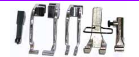
A. Center Groover B. Left Side C. Right Side D. Double Toe E. Blanket Outside F. Blanket Inside

Bobbins for 45K, M-120R, 3/4" x 1 1/8" #15097