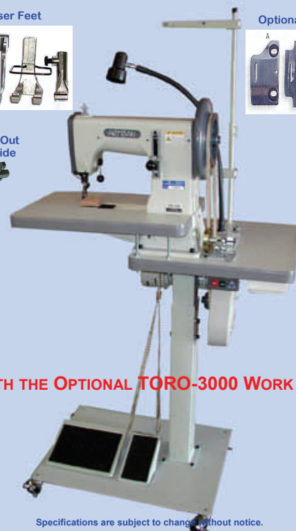
SHOWN WITH THE OPTIONAL TORO-3000 WORK PLATFORM

Specifications are subject to change without notice.