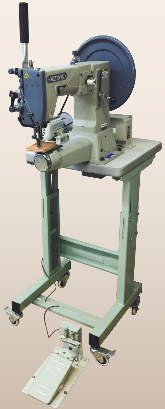
ARTISAN® TORO-3200 on Ped-520 Pedestal