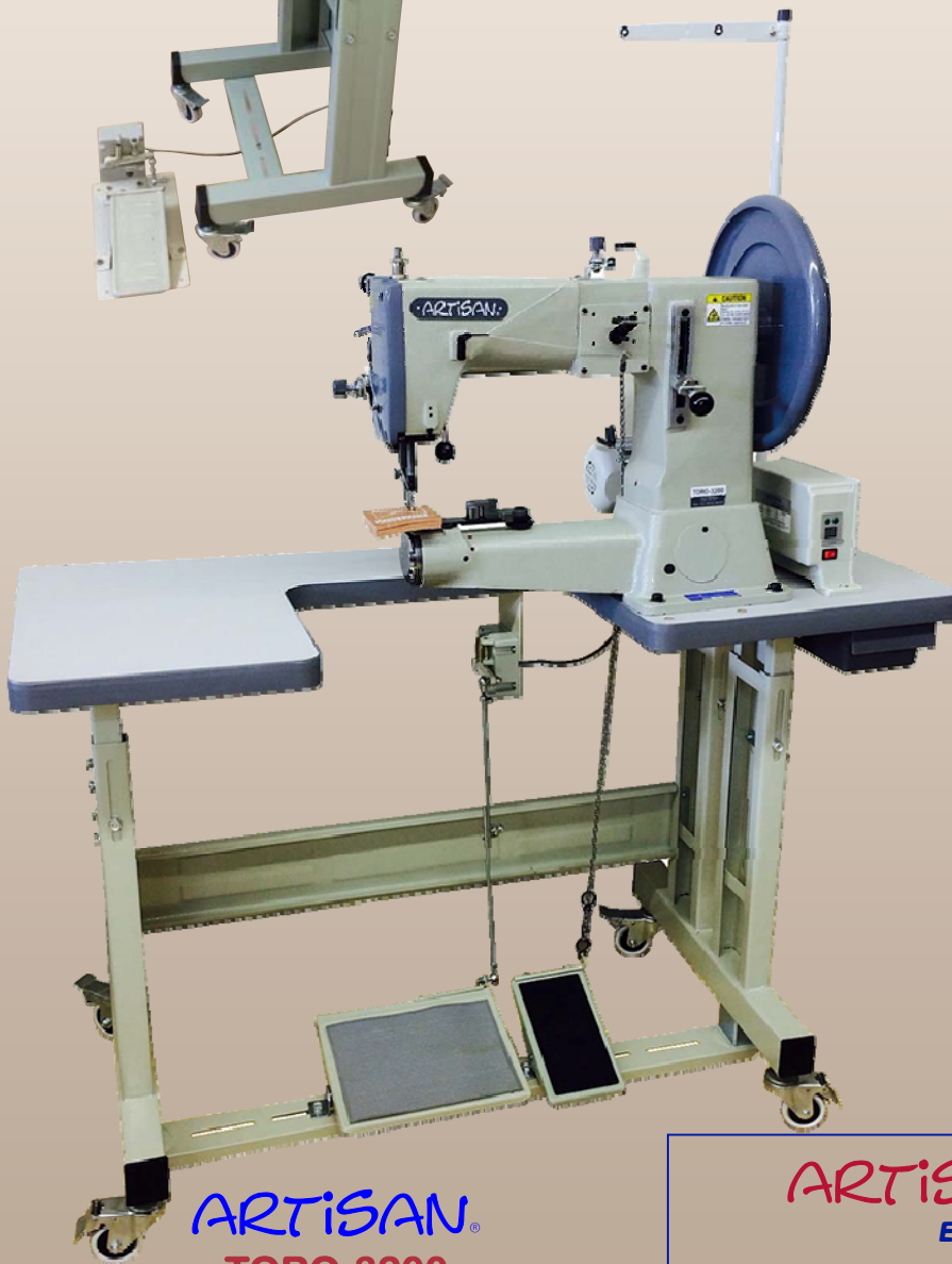
ARTISAN® TORO-3200 on "U" style Servo Motor Drive