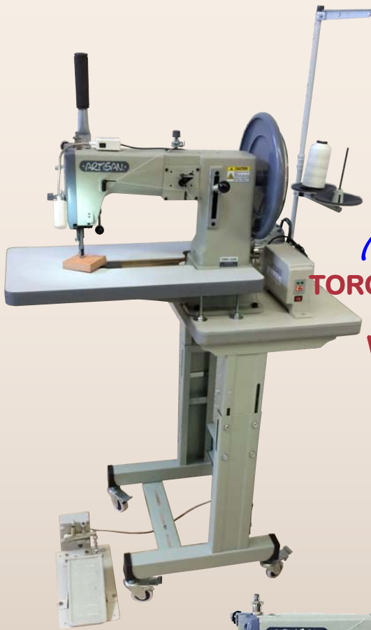
ARTISAN® TORO-3200 on Ped-520 with Optional Work Platform